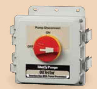
Junction Box with Pump Disconnect NEMA 4X

Complete system - includes pump, contol panel, level sensor, solenoid valves, junction box with disconnect, check valves, reducer couplings and remote alarm (no holding tank)