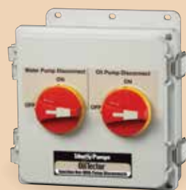
Junction Box with Pump Disconnects NEMA 4X

Complete system - includes pumps, control panel, level sensor, junction box with disconnects, check valves, reducer couplings and remote alarm (no holding tank)